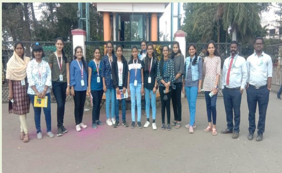
Sanmati Component, Ichalkaranji.