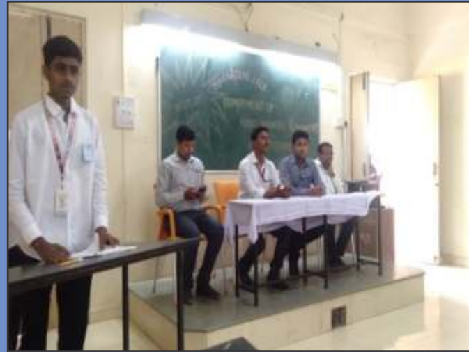
Announcement of the Winners