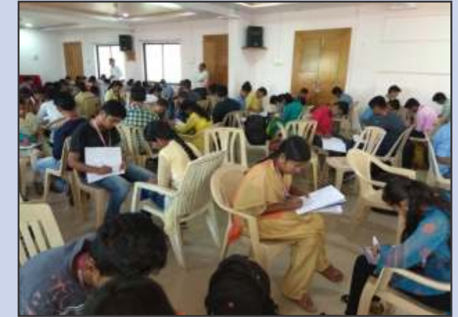
Students Engaged In Self-introduction Activity

Education is the most powerful weapon which you can use to change the world.