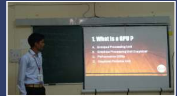
Business Club Activity 11/1/2018 onwards Sem-II