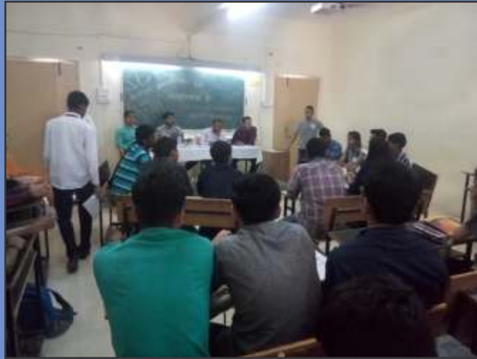
Group Discussion Competition

At Institute National level Technical event 'Innovation 2k18' was organized on 28 th November, 2018. In this event, various department organized special activities and competitions for the students. The Department of Basic sciences and Humanities organized the events of Group Discussion and Advertisement and total 113 students registered their names & participated. Such kind of events are being organized by the department where students develop their teambuilding skills, presentation skills and also become aware with the competitions held at outside world.