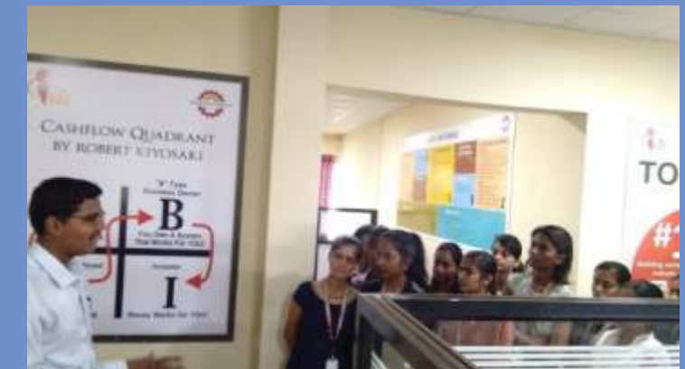
Senior-Junior student interaction about the idea of 'Start-up'