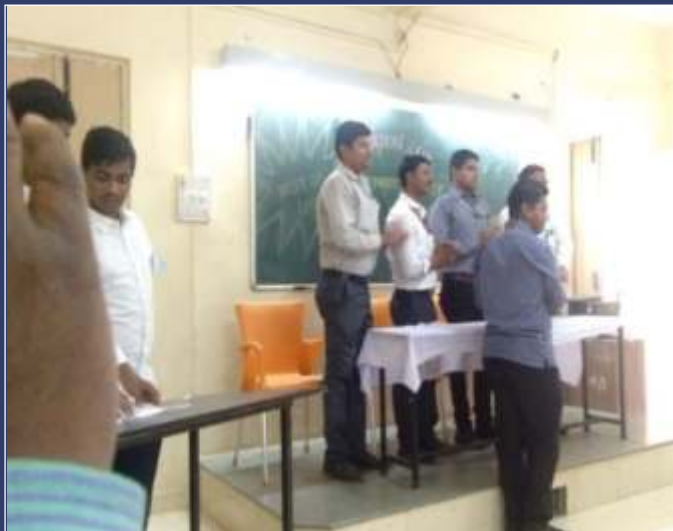
Technical Event Winners Honored With Prize Distribution