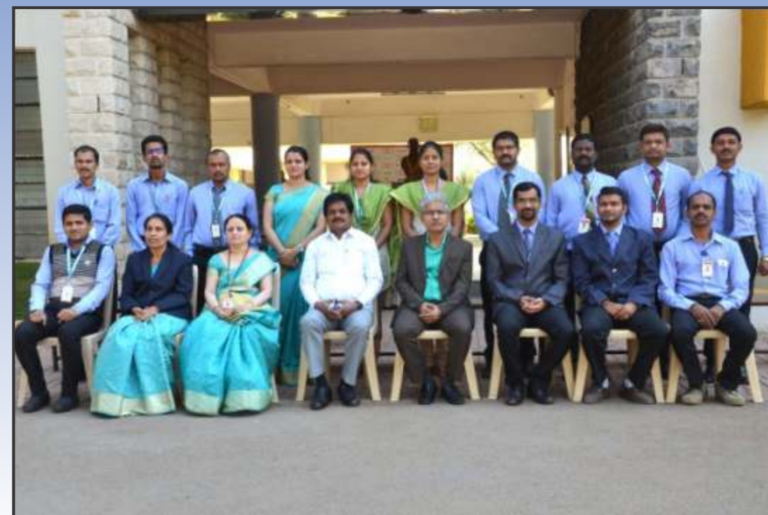
Staff members with Executive Director, Principal, Vice-Principal and Deans