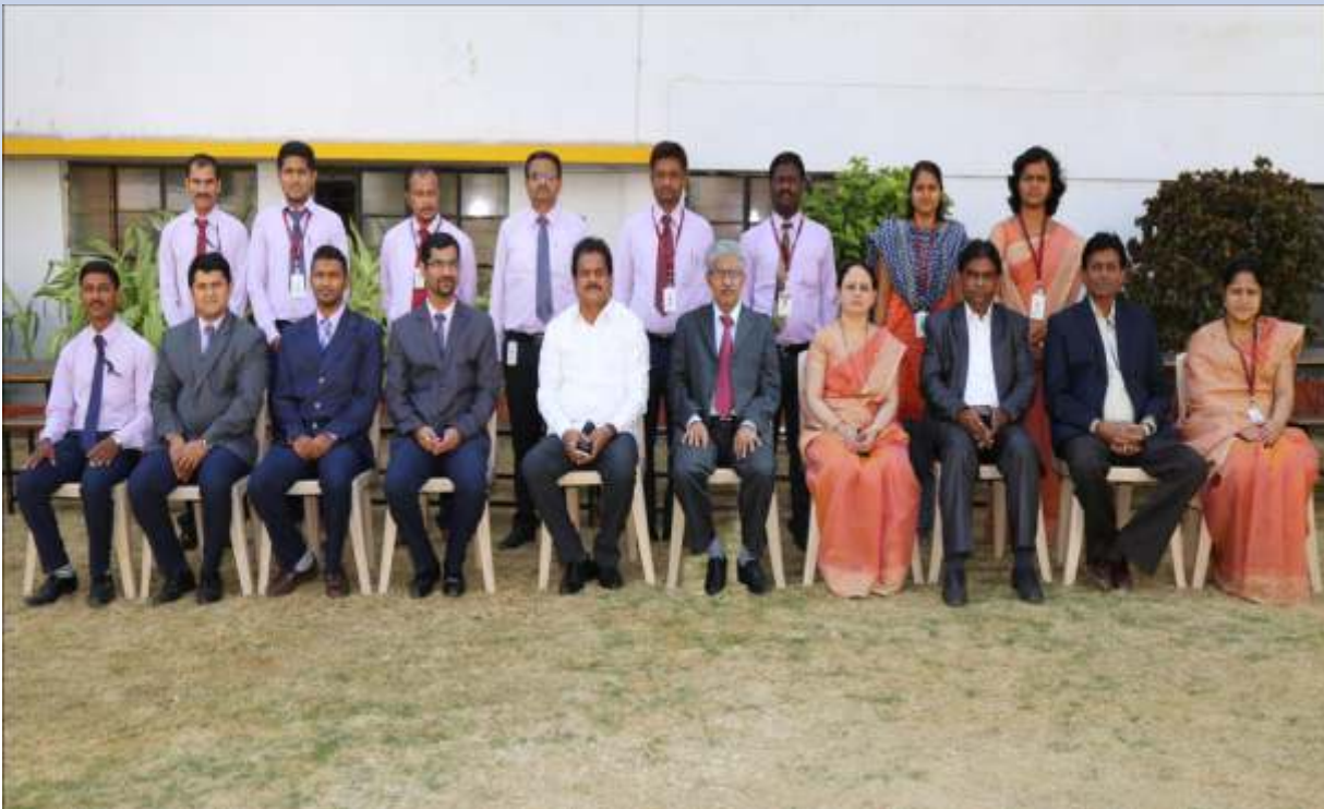
Staff members with Executive Director, Principal, Vice-Principal and Deans

“Education is the most powerful weapon which you can use to change the world.” -Nelson Mandela