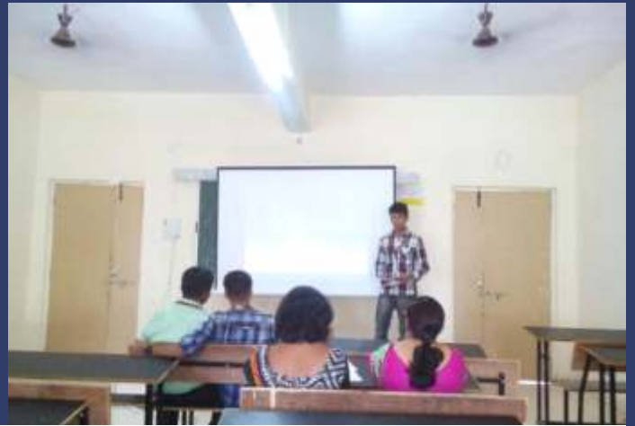
Contestants of GD discussing on the topic