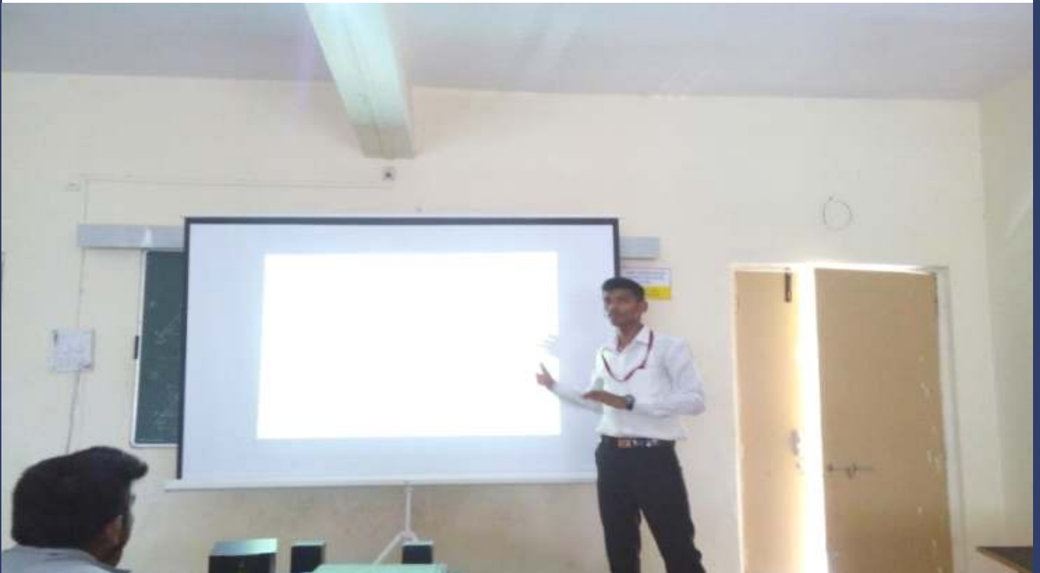
An aspirant during his PPT presentation ...