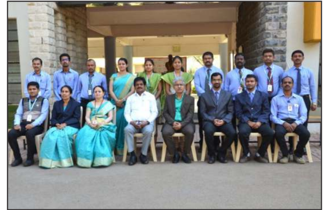
Staff members with Executive Director, Principal, Vice-Principal and Deans