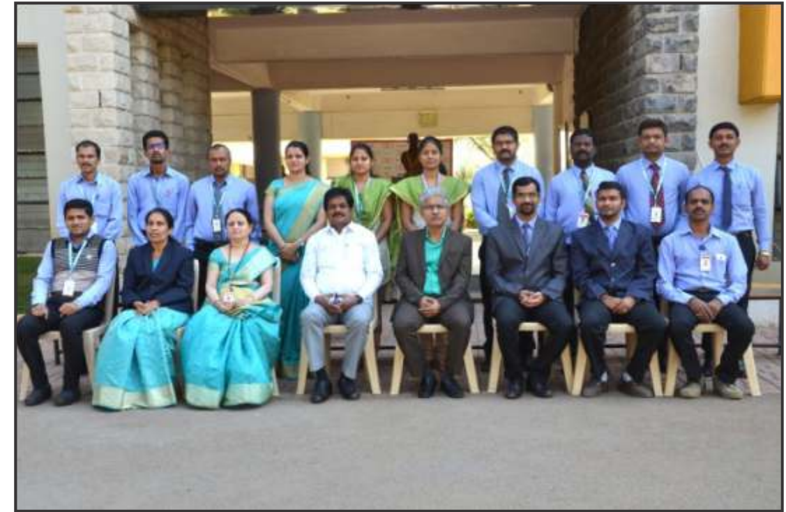
Staff members with Executive Director, Principal, Vice-Principal and Deans